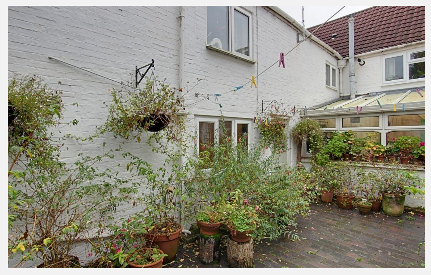
Flat 3,15a Warminster Road Westbury BA13 3PD